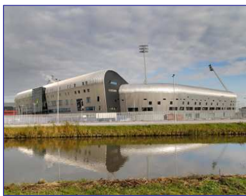
ADO stadion Den Haag