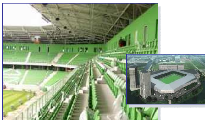
Euroborg stadion Groningen