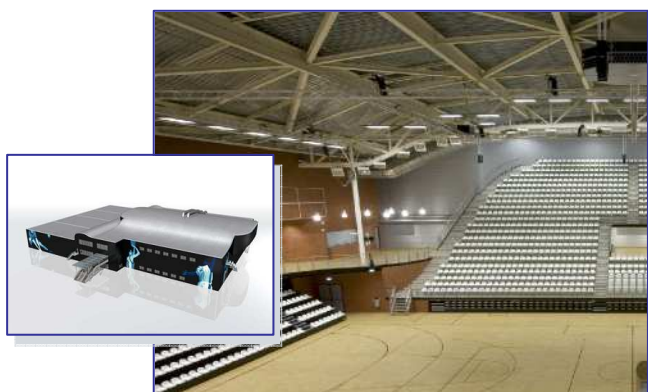
Sportcentrum Olympiakwartier, Almere Poort